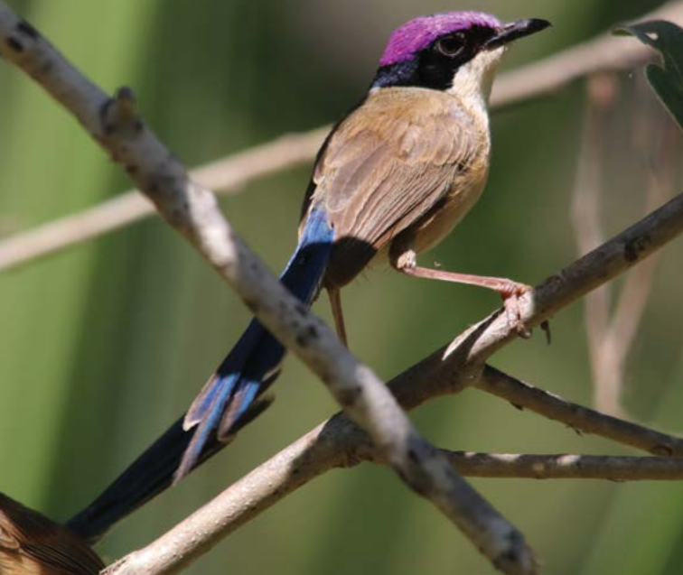
Above Purple crowned fairy wren.

The various species of snakes found in the region include Stimpson's, water, olive and dumladnardi (the black-headed python). Snakes of the Elapidae family; that is front-fanged snakes, include the venomous mulga, western brown snakes and the black whip snake, reputed to be the fastest species of snake in Australia! Remember snakes are a vital part of the ecosystem and if you leave them alone, they will leave you alone.