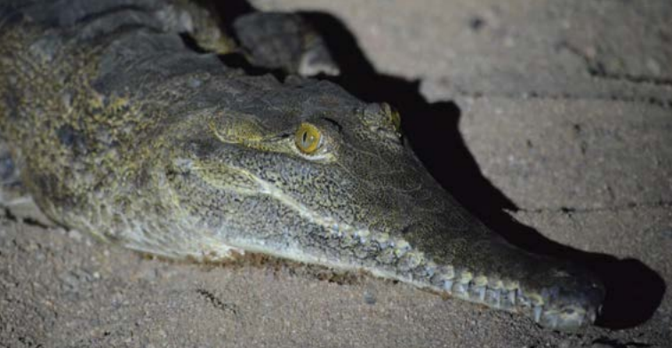
Above Freshwater crocodile.