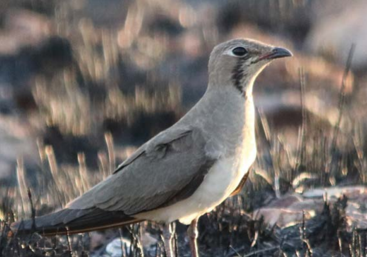
Above right Oriental pratincole.