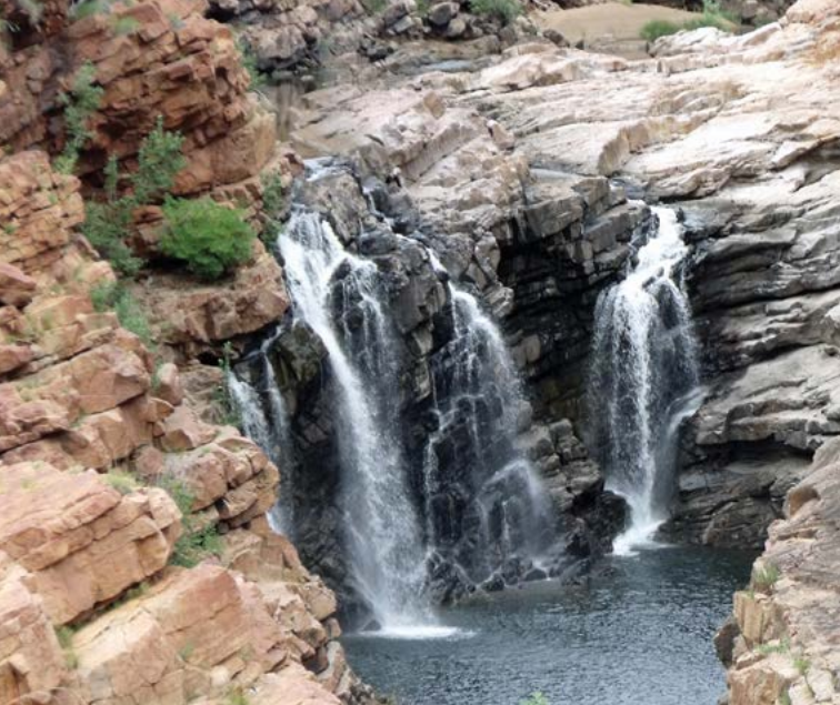
Above Lennard Gorge.