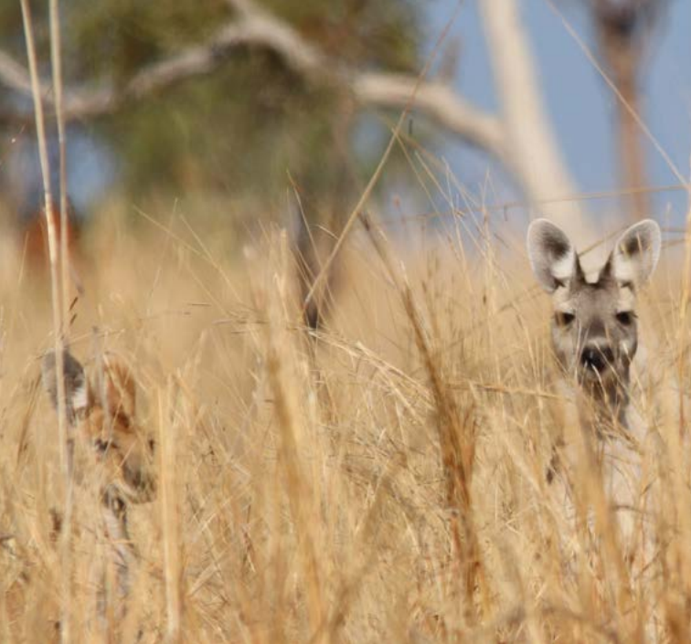
Above Antilopine wallaroo and joey.