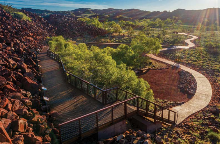
Above Nganjarli Trail.