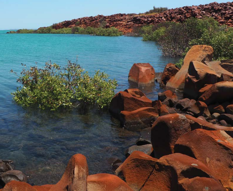
Above White mangrove ( Avicennia marina ) at high tide.