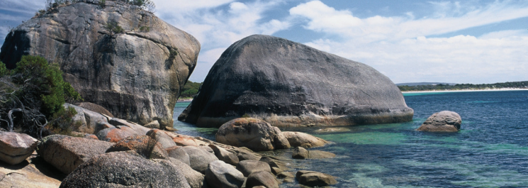
Fairy Rocks, Two Peoples Bay Nature Reserve.