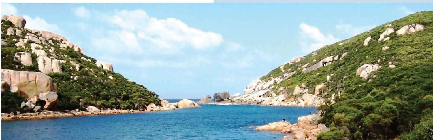
Waychinicup River Inlet.

A complex patchwork of forest, woodlands, wetlands, sedges, granite shrublands and coastal heath covers the landscape. The wetlands and sedgelands are of special importance to bird species, including noisy scrub-birds, which have been reintroduced to this area.