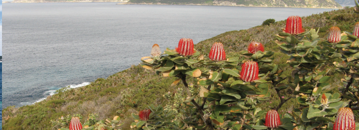
Gull Rock National Park.