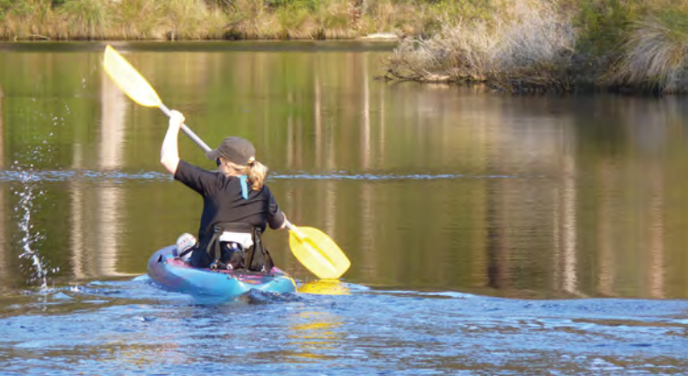
Above Paddling on the Frankland River.