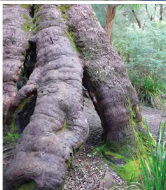
Top Coalmine Beach. Above Circular Pool. Above right Giant Tingle Tree.