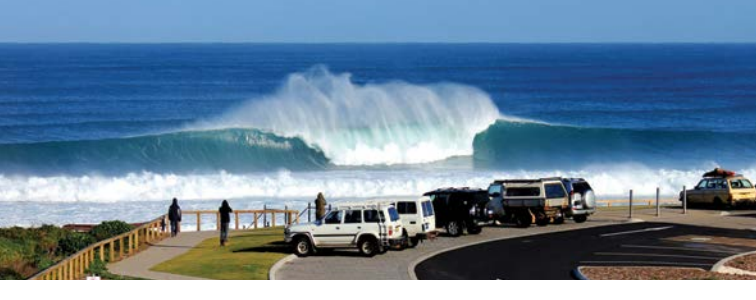
Above Perfect surf at Margaret River's Main Break.