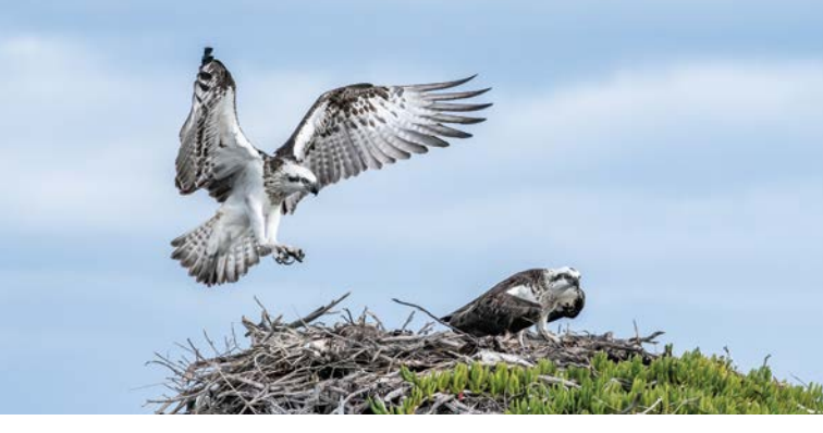
Above Osprey.