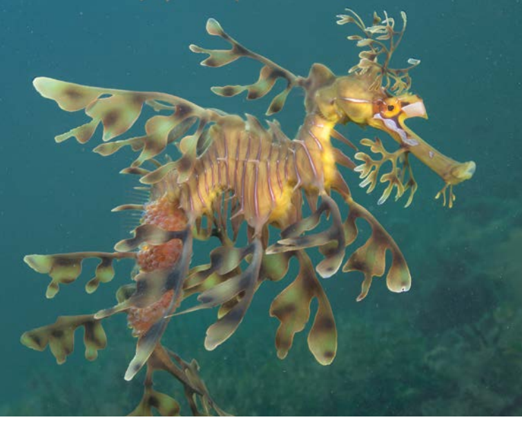
Above Leafy seadragon.