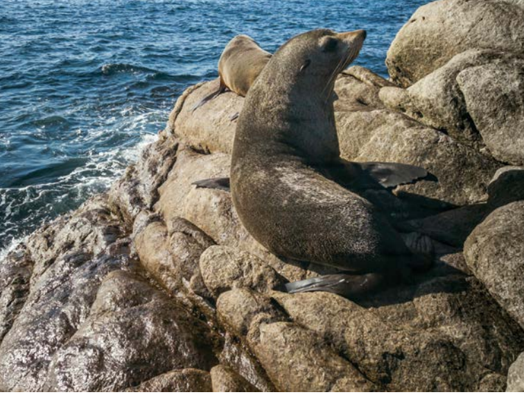
Above Long-nosed fur seal.