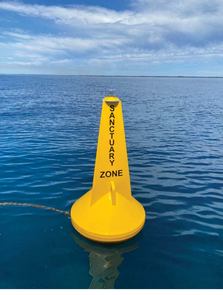
Above Sanctuary zone marker.