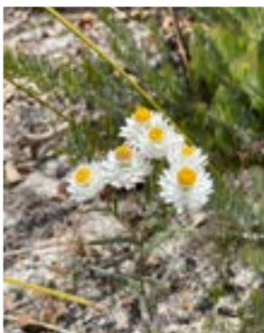
Everlasting Daisy Helichrysum macranthum

The park is dominated by the river valley. Large flooded gums grow on the river's edge and flood plain. Wandoo grows on the sides of the valley, with marri and powderbark woodlands and forests being common on the uplands, and jarrah on the high ridges only. Extensive heaths contain an array of wildflowers including hakeas, grevilleas, isopogons, petrophiles and verticordias. In spring a profusion of plants flower in the mosaic of heaths, granite outcrops and woodlands throughout the park. A large variety of other plants may be seen, including zamia, hibbertias, triggerplants, banksias, grevilleas, and at least 12 orchid species.