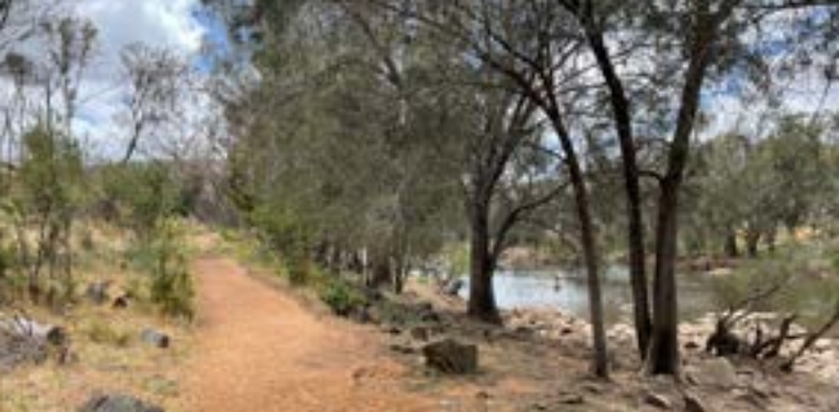
Above The Aboriginal Heritage Trail.