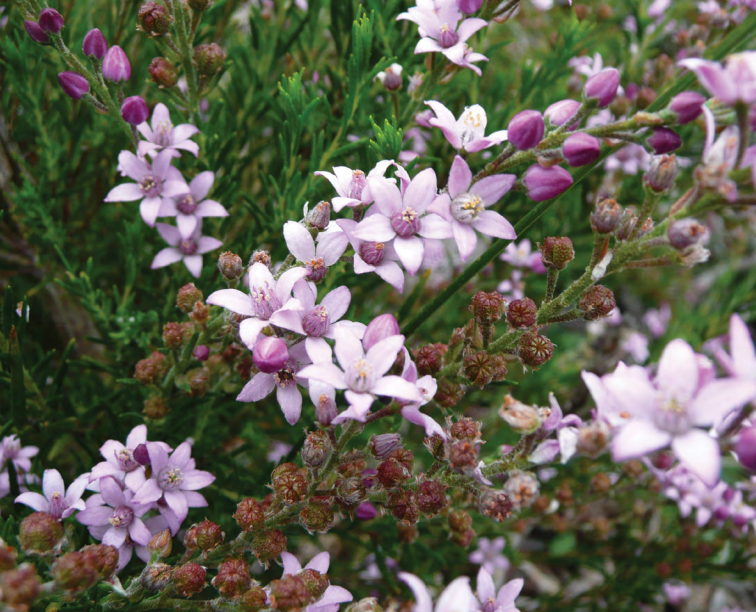
Above Philotheca spicata .