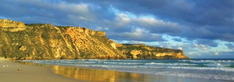
Above Salmon Beach at Point D'Entrecasteaux.