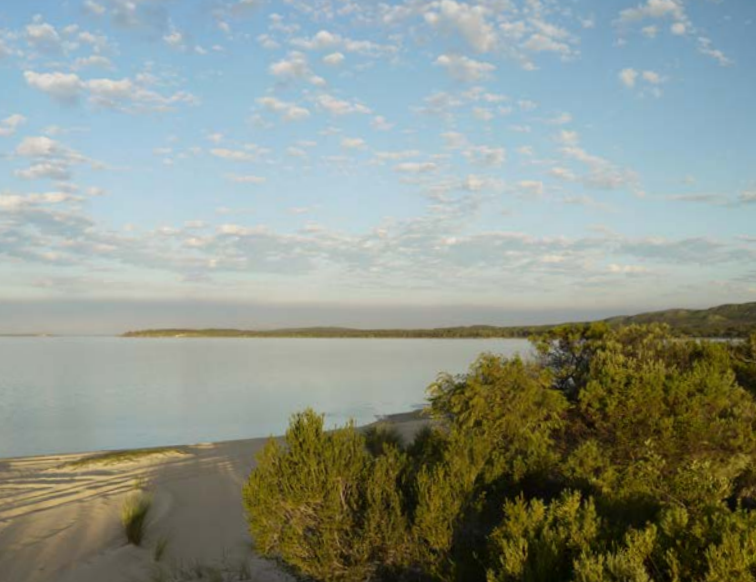
Above Broke Inlet.