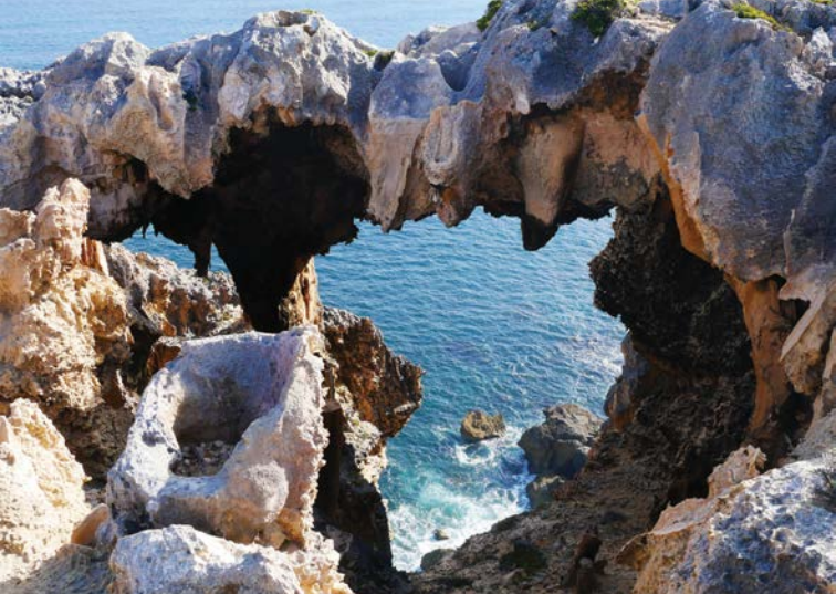
Above The Windows, Point D'Entrecasteaux.