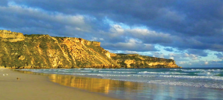
Above Salmon Beach at Point D'Entrecasteaux.