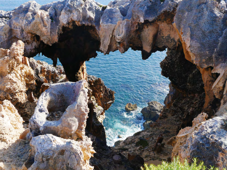
Above The Windows, Point D'Entrecasteaux.