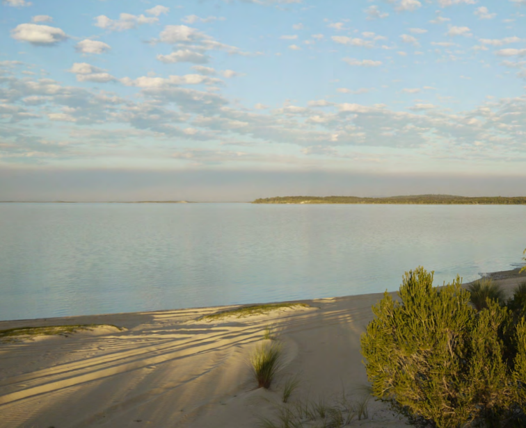
Above Broke Inlet.