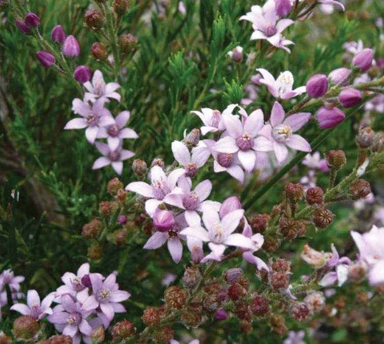
Above Philotheca spicata .