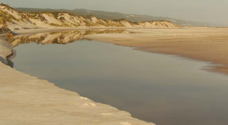
Above Mouth of Warren River.