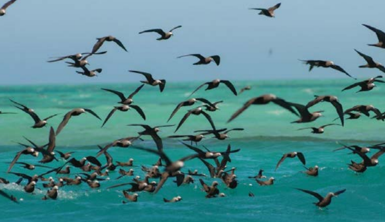
Above Lesser noddies.