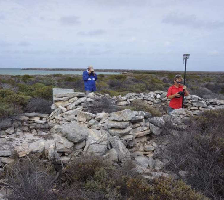
Above WA Museum and University of WA archaeologists recording the Batavia (1629) survivor camp structure on West Wallabi Island.