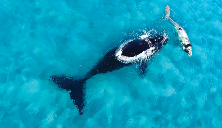
Above Southern right whale mother and calf.