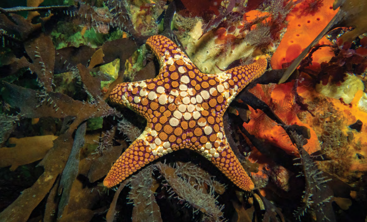
Above Sea star.