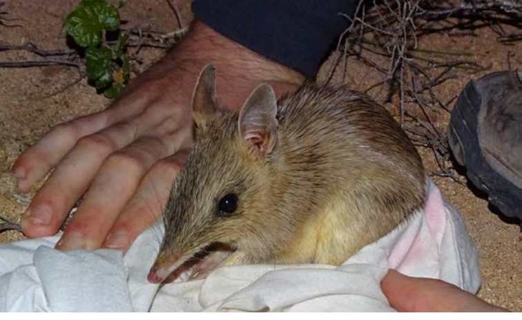
Above Shark Bay bandicoots were returned to the Island in 2019.