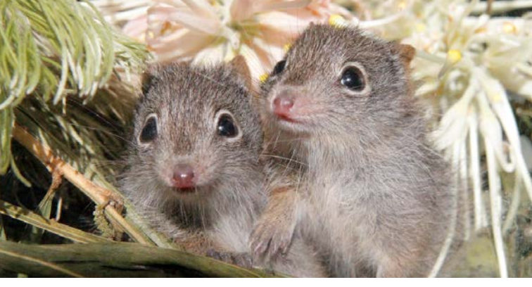
Above Reintroduction of dibblers bred at Perth Zoo began in 2019.