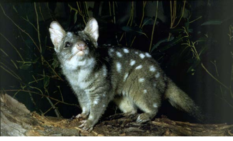
Above A predator, the chuditch will be the last animal species returned to the island.

Take care to avoid native animals at all times when driving on the island. Please note: