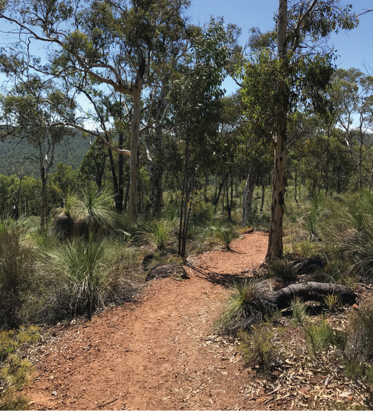
Above Walking trail South Ledge.