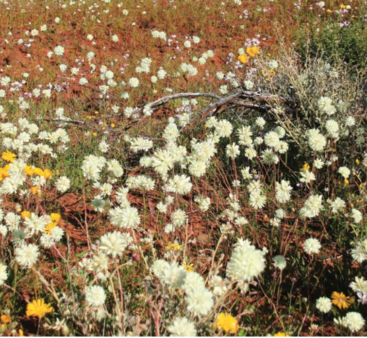
Above Image caption.