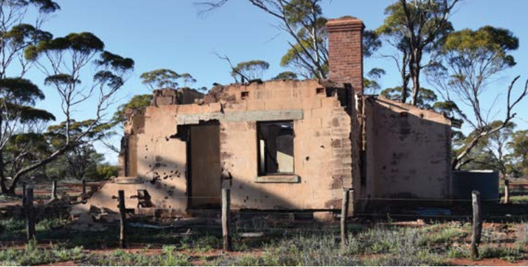
Above Ruins at Damperwah State Farm.