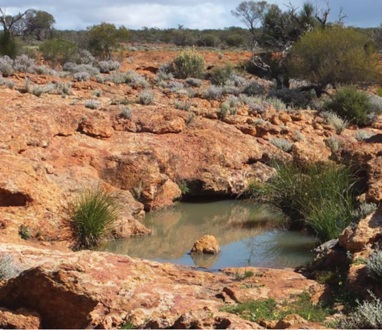
Above Karara Rangeland Park waterhole.