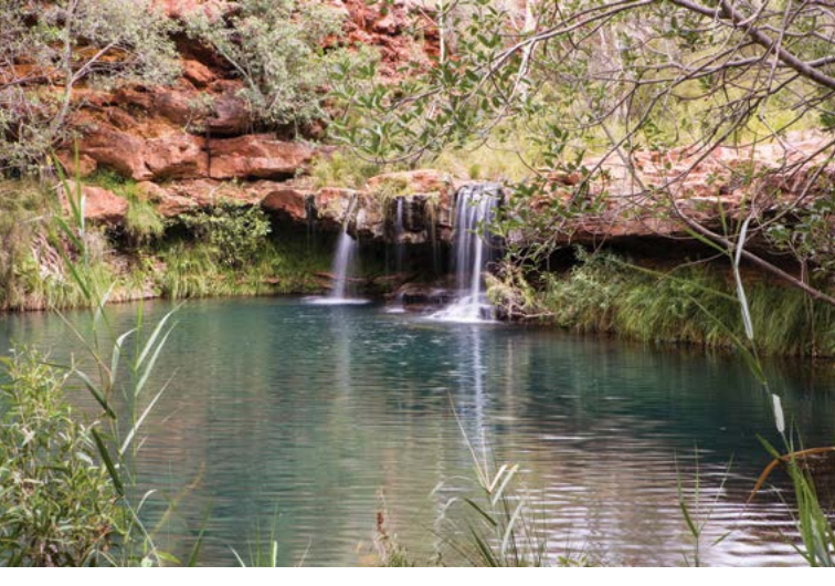
Front cover Fortescue Falls. Above Fern Pool.