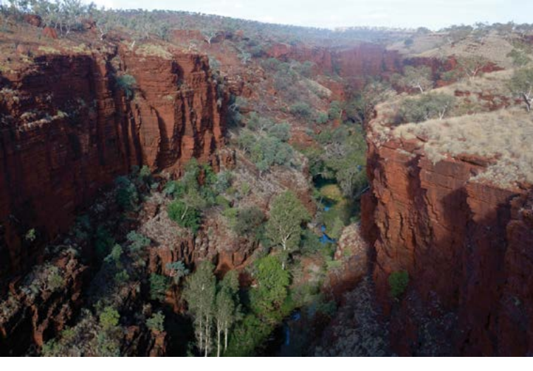
Above Knox Gorge.