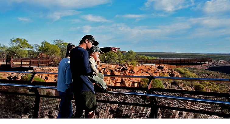
Above Kalbarri Skywalk (kaju yatka).