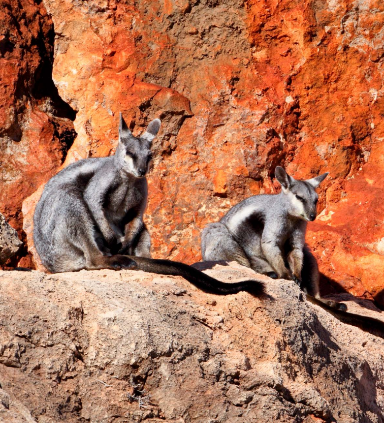
Above Often seen at Hawks Head lookout, this rare black-flanked rock-wallaby is bouncing back from the brink with careful park management.