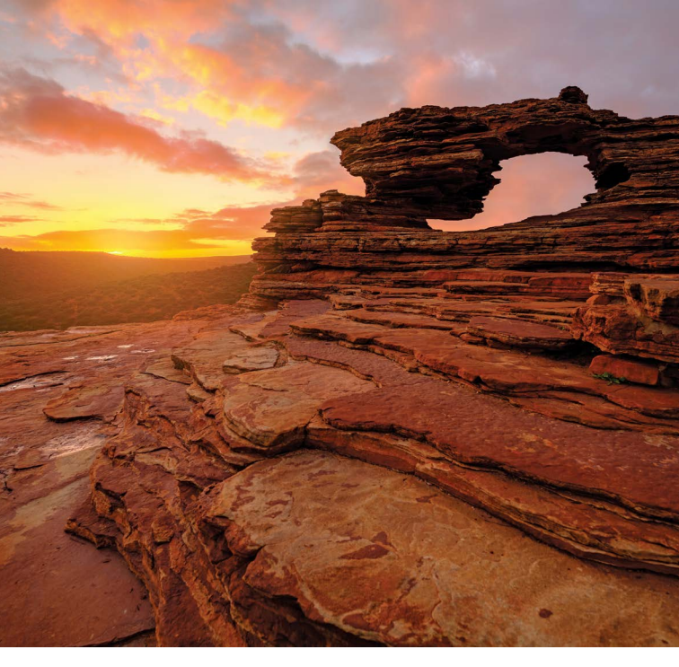
Cover Kalbarri Skywalk (kaju yatka). Above The Loop, Nature's Window.