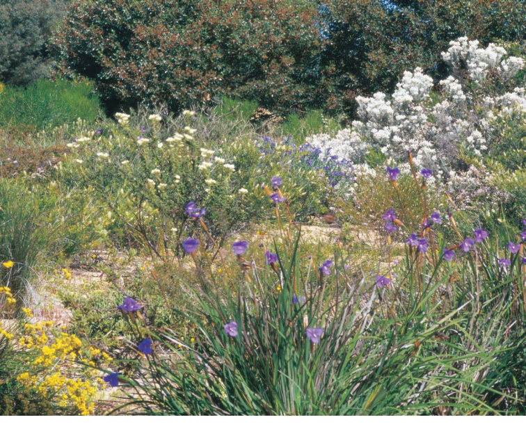
Above Wildflowers, Kalbarri National Park.