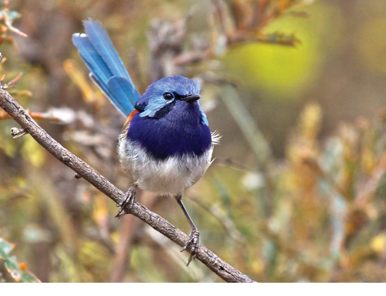
Above Blue-breasted fairy wren.