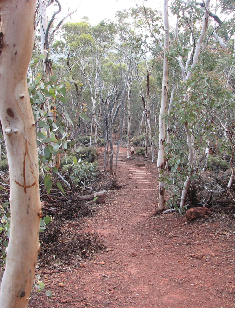
Above Ochre Trail.