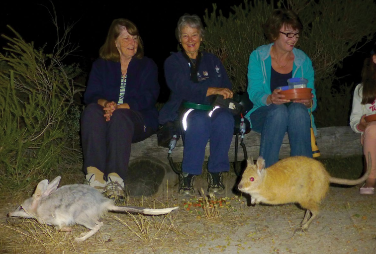
Above Barna Mia tour, mala chases bilby.